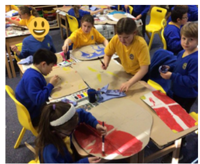
Year 6 news: -

Year 6 have been challenging gender stereotypes, whilst designing toys for boys and girls.