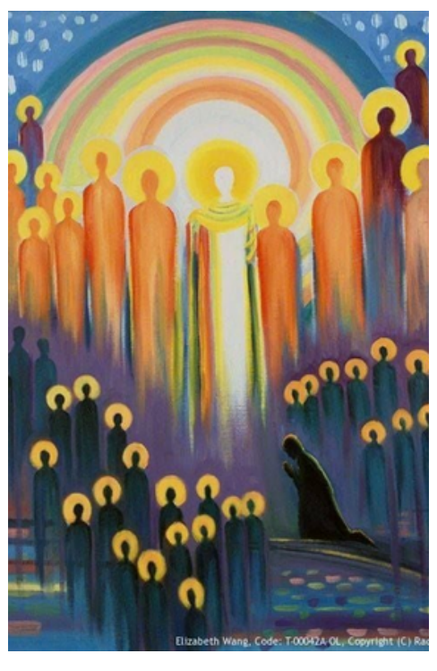
This week's news